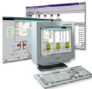
5100V/5180V Recorders & 21 CFR Part 11